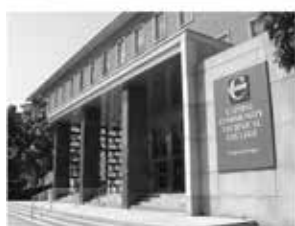
Woodland Street, opened 1974