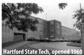
Hartford State Tech, opened 1960

Since the late 1960s more than 300,000 students have enrolled and more than 16,000 degrees and certificates have been granted. One of 12 community colleges in Connecticut, Capital is one of New England's most ethnically diverse campuses.