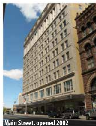
Main Street, opened 2002