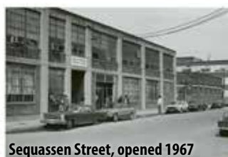
Sequassen Street, opened 1967